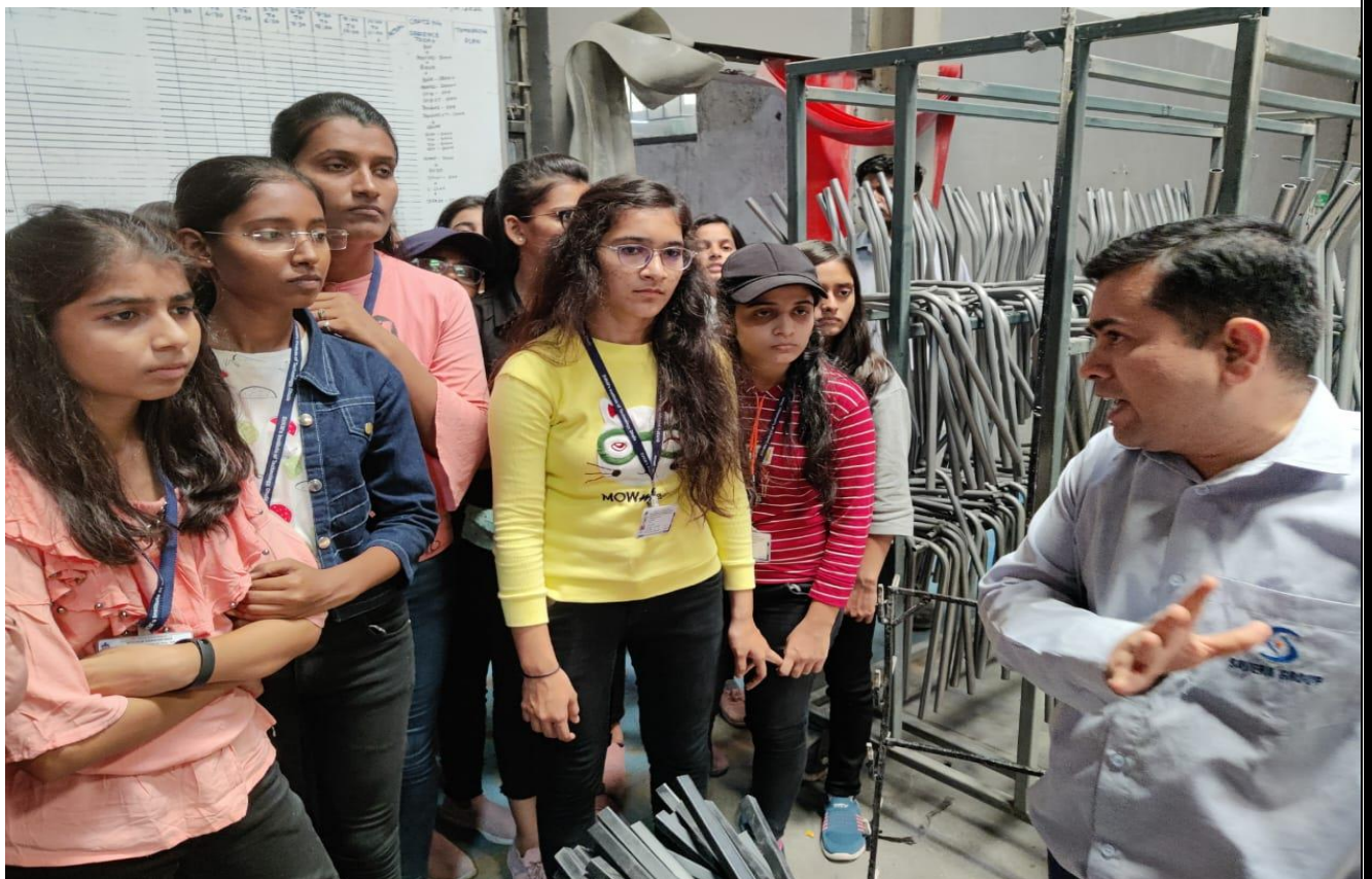
Manager of the Company informing to the students about the functioning.