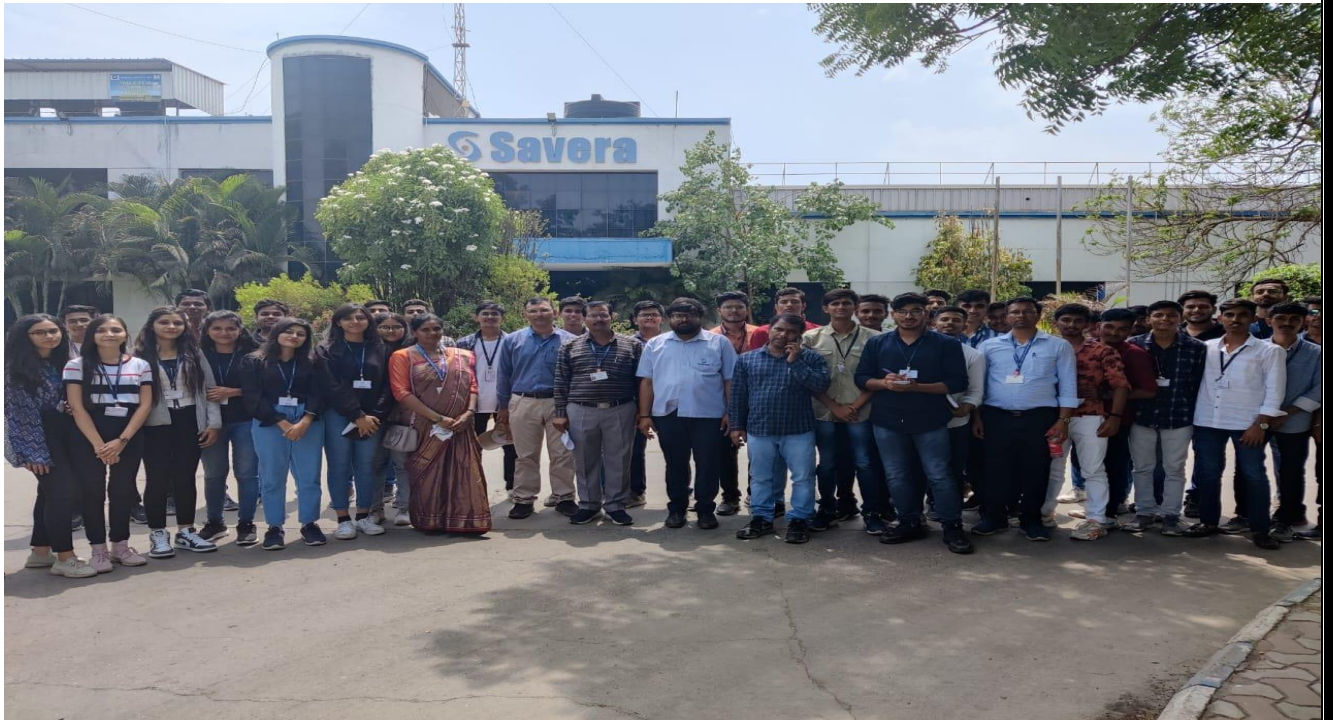
Visit at Savera Moulding Pvt. Ltd. Aurangabad