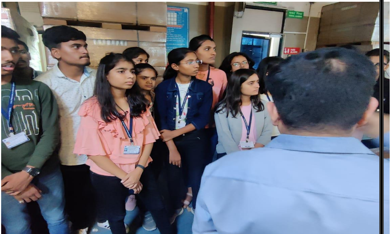
Manager of the Company informing to the students about the Plant.